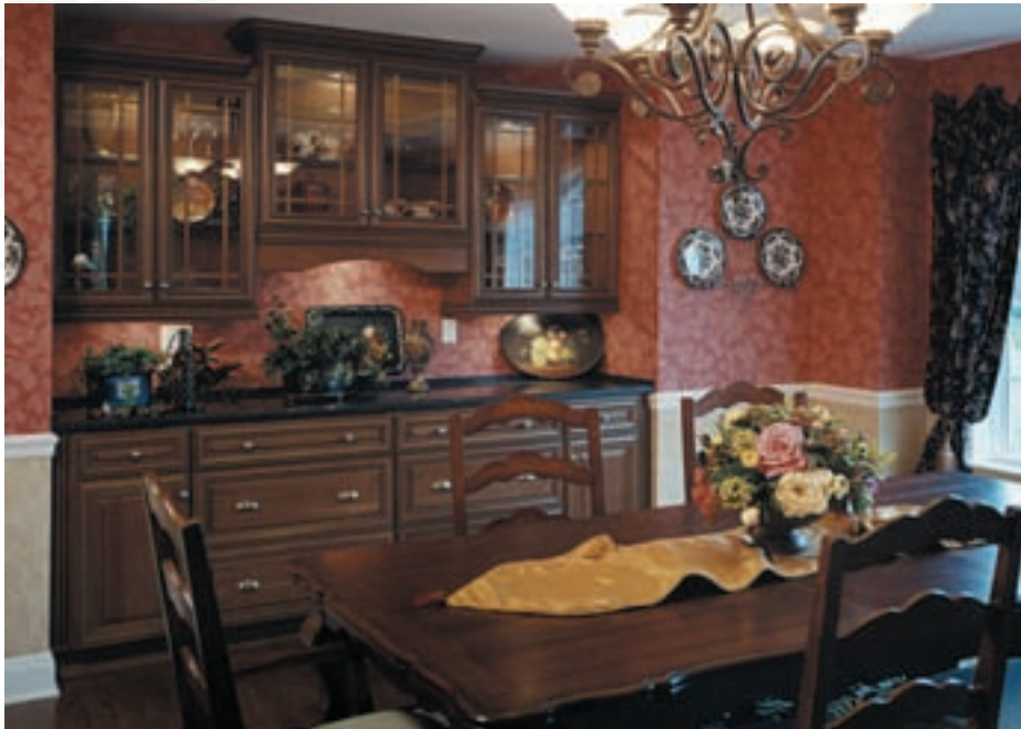
CAMBRIDGE | CHERRY WOOD | SPICE FINISH | EBONY GLAZE

CAMBRIDGE DINING ROOM Cambridge Cherry Spice with Ebony glaze gives this traditional dining room just the right touch of Old World sophistication. Note how the rich, deep cherry tones anchor the room and emphasize the impression of elegance and fine living. Glass mullion doors complete the sense of depth and dimension.