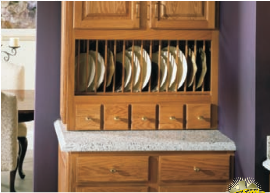
HERITAGE | OAK WOOD | LIGHT FINISH