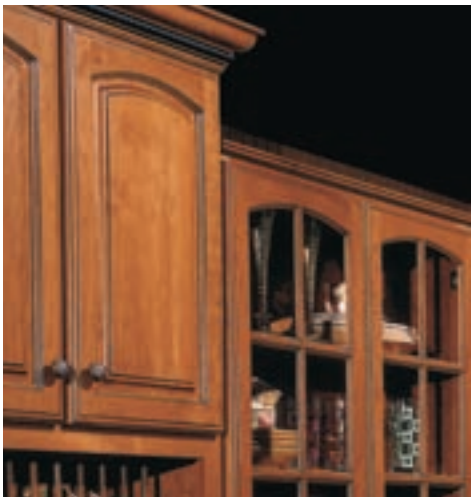
Arch doors and Ebony glaze accent the homespun charm of Jamison Cherry Spice while glass mullion doors add depth and dimension.

JAMISON KITCHEN Transform your home into a French Provincial cottage with Jamison Cherry Natural. Here, a Mist glaze lightens and brightens the wood's natural tones while arched and curtained glass-mullion doors heighten the cottage effect. Decorative scrollwork and contrasting apothecary drawers complete this delightful setting.