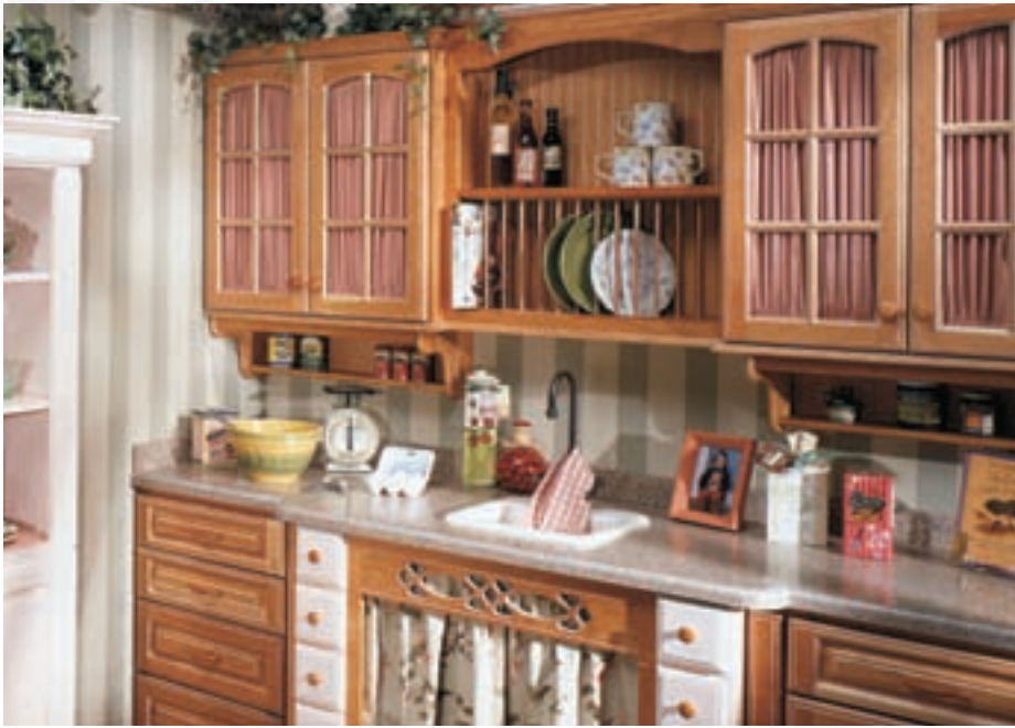
JAMISON | CHERRY WOOD | NATURAL FINISH | MIST GLAZE

JAMISON KITCHEN Transform your home into a French Provincial cottage with Jamison Cherry Natural. Here, a Mist glaze lightens and brightens the wood's natural tones while arched and curtained glass-mullion doors heighten the cottage effect. Decorative scrollwork and contrasting apothecary drawers complete this delightful setting.