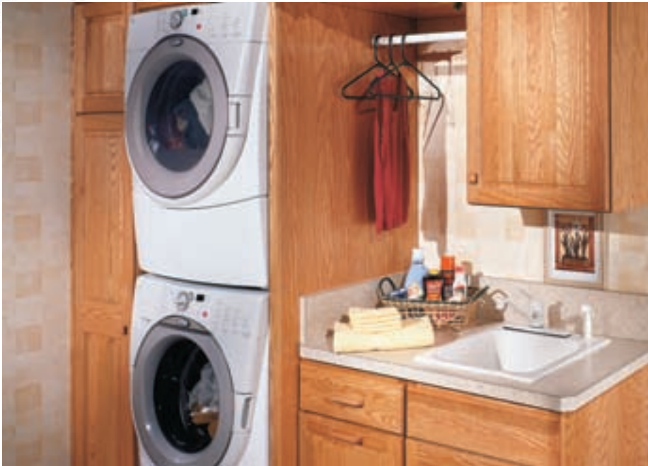
JAMISON | OAK WOOD | LIGHT FINISH

JAMISON LAUNDRY ROOM Functional? Of course. Durable? Certainly. Stylish? Absolutely! This practical laundry room in Jamison Oak Light is a masterpiece of clean lines, rugged strength and the timeless beauty of genuine oak. Stacked appliances with oak trim panels combine eye-level convenience with a broad expanse of natural oak hardwood that rivals custom cabinetry. And look at all the organization space!