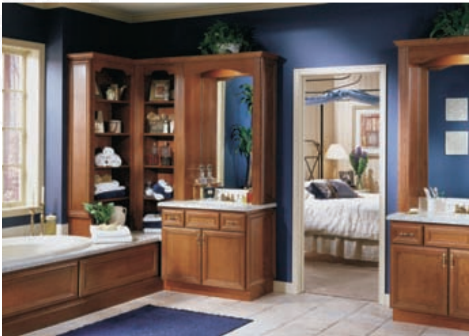
MADISON | CHERRY WOOD | SPICE FINISH

MADISON BATHROOM No matter the season, your bathroom will always be warm with Madison Cherry Spice. Its warm glow complements virtually any décor and gives any setting an air of solace and relaxation. Vertical beading and mitered crowns lend an air of classical good taste.