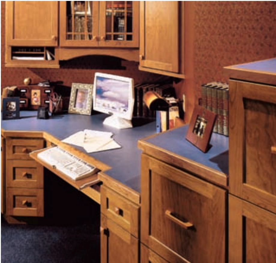
SEDONA | CHERRY WOOD | SPICE FINISH

SEDONA OFFICE Productivity has never been so stylish! This home office in Sedona Cherry combines understated good taste and common-sense practicality. Mullion doors showcase decorative items, while filing cabinets and a sliding keyboard console put everything literally at your fingertips. Subdued lighting and Sedona Cherry's soothing Spice finish complete this picture of calming, non-stressful warmth. For work or play, Sedona Cherry is a natural!