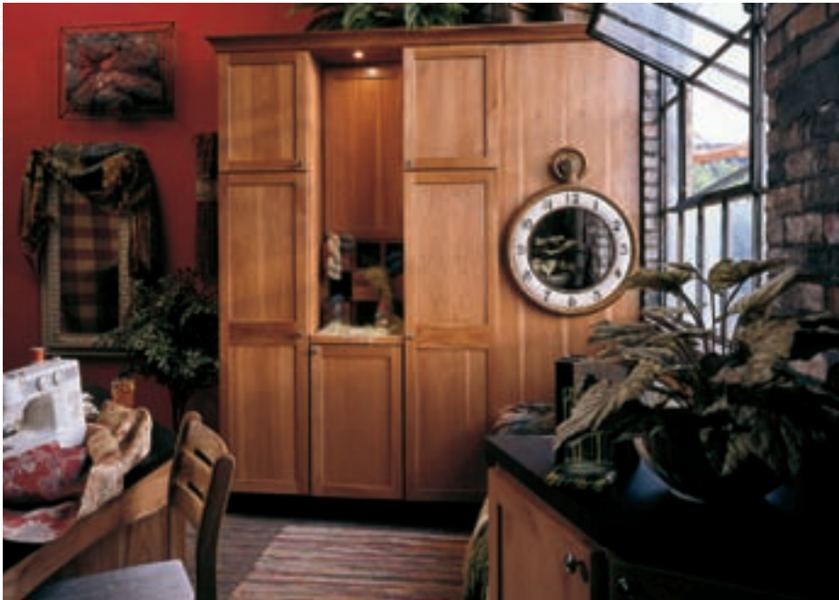
SEDONA | HICKORY WOOD | LIGHT FINISH

SEWING STUDIO Give your spirit of creativity room to soar in this innovative Sedona Hickory Light studio. Tall utility cabinets and stacked apothecary drawers provide plentiful organization space, while the desk-high sewing center gives you room to spread out your projects. Need more ideas? Just curl up on your cushioned window seat and let your imagination run wild.