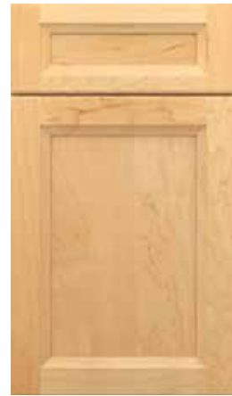
BEXLEY 5-PIECE M P H