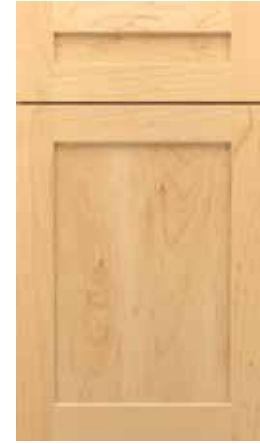
SEDONA 5-PIECE F M M P O H R