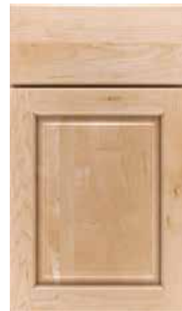
WELZIN F M M P O H