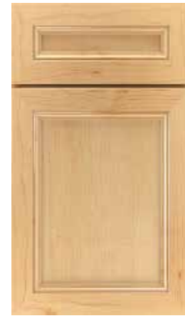
BISHOP 5-PIECE M P O