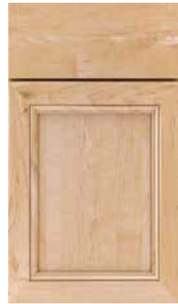
BISHOP M P O