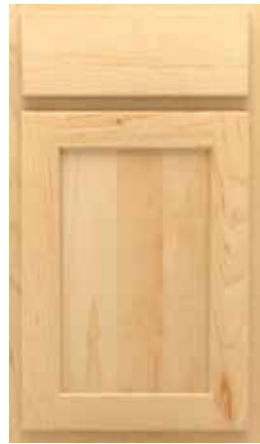
ARBOR M P O H R