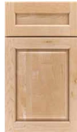
WELZIN 5 PIECE F M M P O H