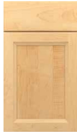
BEXLEY M P H