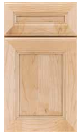
HIGHLAND 5-PIECE M P