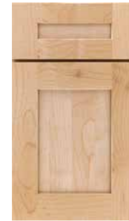
DARWYN 5-PIECE M P O H R