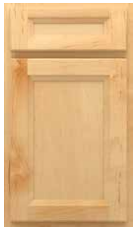
LAUTNER 5-PIECE M P H