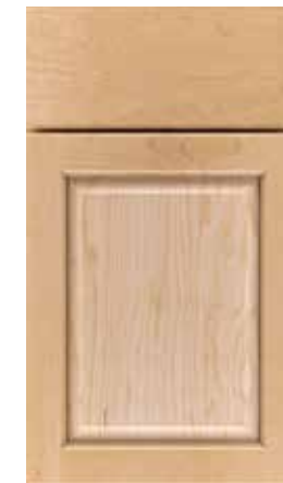
PIPER M P O H