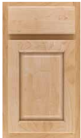
FYFER M P O H