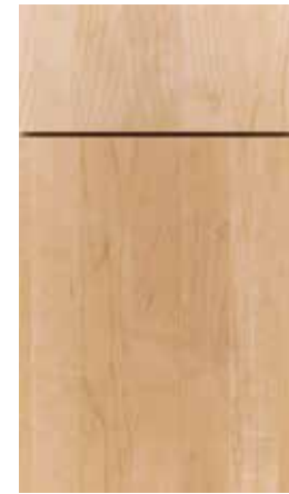
CHALET M P