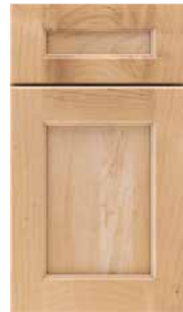
WALDRON 5-PIECE F M M P H O