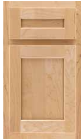
ARBOR 5-Piece M P O H R