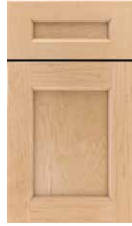
ROSEDALE 5-PIECE F M M P