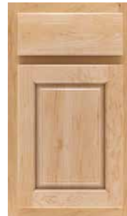
WEXFORD T M P H O R