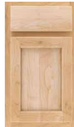
KENOSHA M P H O