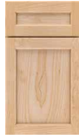
KENDRICK 5-PIECE M P H O