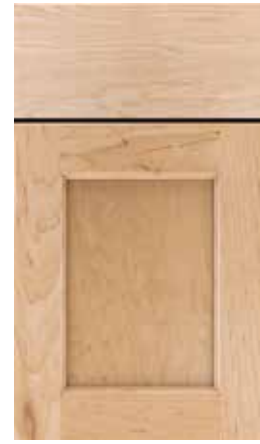
ROSEDALE F M M P