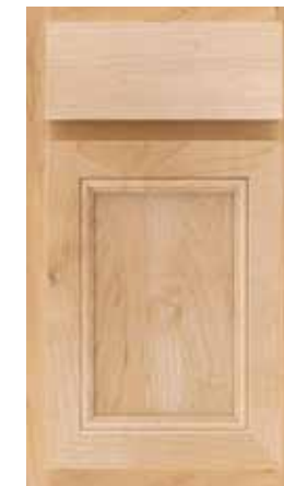
JOPLIN M P O