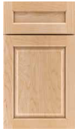
PIPER 5-PIECE F M M P O H