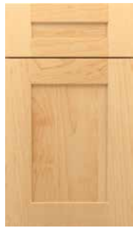
DOVER 5-PIECE M P O H R