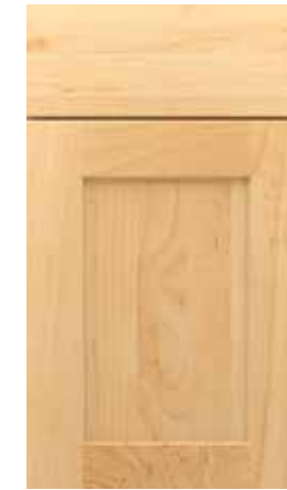
DOVER M P O H R