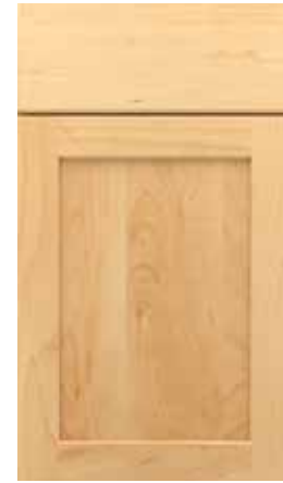
SEDONA F M M P O H R