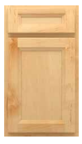
LAUTNER 5-PIECE MPH