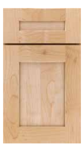
DARWYN 5-PIECE 🖪 🖾 MPOHR